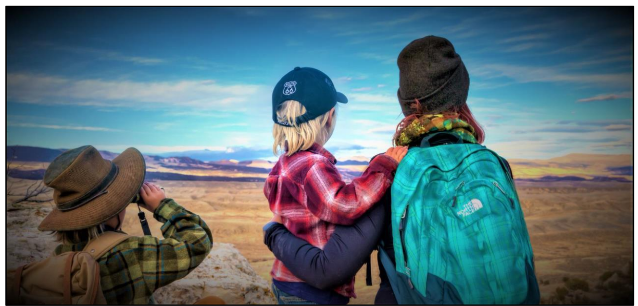
Figure 1: Visitors enjoying John Wesley Powell NCA

The NCA offers remote, rugged, and primitive recreation opportunities such as hiking, hunting, sightseeing, photography, wildlife viewing, camping, backpacking, off-road vehicle use on existing roads, and equestrian use. Although current visitation to the NCA is relatively low, it is anticipated that with the new designation of the NCA and future outcomes-based planning, visitation will increase. Visitation has been and will continue to be considered, tracked, analyzed, and planned for in future implementation level activities.