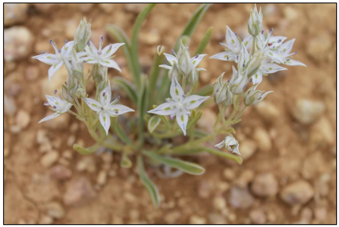
Figure 2: Frasera Ackermanae or Ackerman Green Gentian