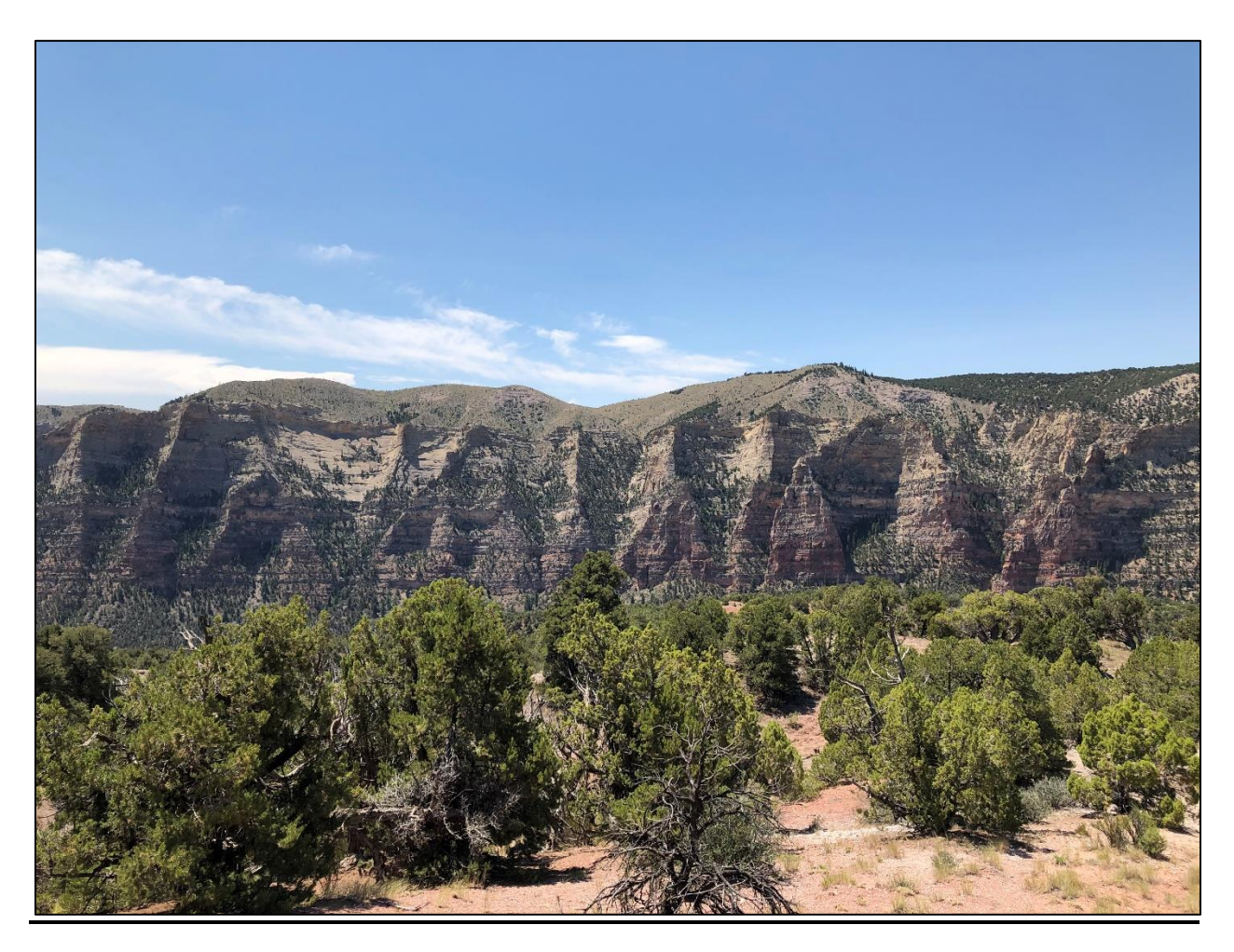
Figure 3: Sandstone cliff bands in Diamond Gulch, John Wesley Powell NCA.