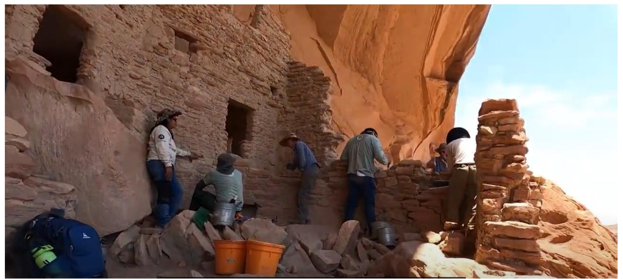
Figure 4: An Ancestral Lands Corp crew works to stabilize the River House ruin in Bears Ears NM.

The BENM continues to work with Tribal Nations and partners on plans for making other already-popular sites visitor ready, which could involve improved trailhead signage, installations of facilities such as restrooms in key areas, better routing through sites, and a campaign to encourage visitors to view fragile sites from a distance.