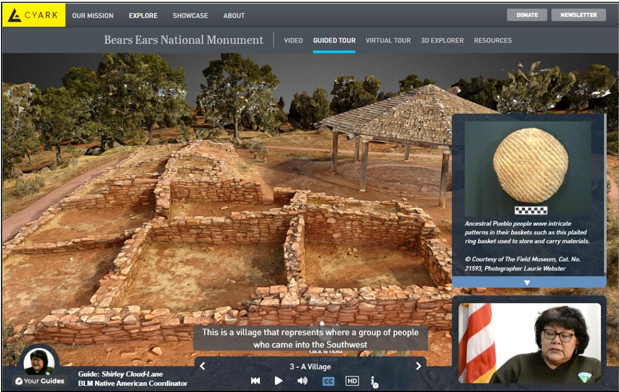
Figure 5: Screenshot of Mule Canyon Village 3D virtual tour.

To increase visitation opportunities while protecting fragile cultural sites, the BENM has partnered with Cyark, a non-profit that works with local partners to produce three dimensional digital tours. In 2021, Cyark and the BENM released online tours for the popular House on Fire and Mule Canyon Kiva sites, which can be found at <a href="https://www.cyark.org/projects/bears-ears/Guided-Tours">https://www.cyark.org/projects/bears-ears/Guided-Tours</a>.