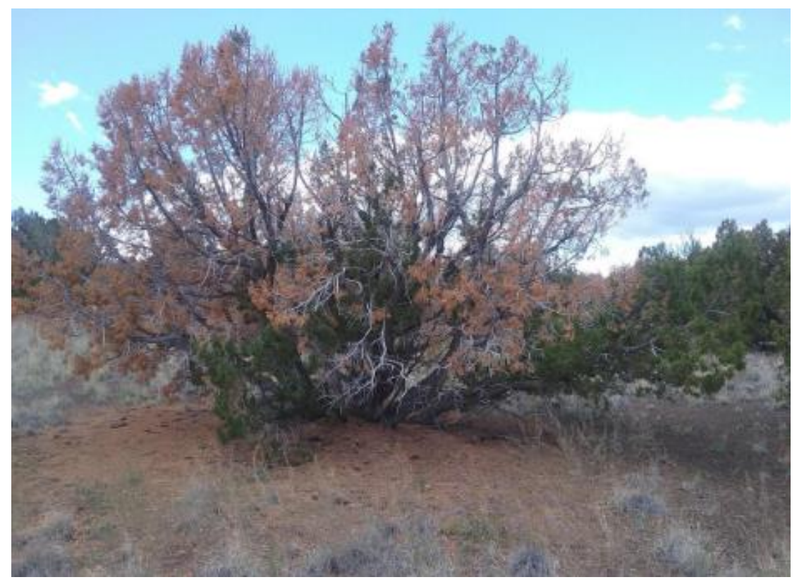
Figure 7: Drought-stressed juniper tree.

Among visitors to the BENM, backpackers have felt the effects of the drought most acutely, because they have had to carry more water against the possibility of dried springs, which has affected trip itineraries. However, sight-seeing visitors have also noticed the pinion juniper mortality, which is apparent along State Route 95 under the Bears Ears buttes.