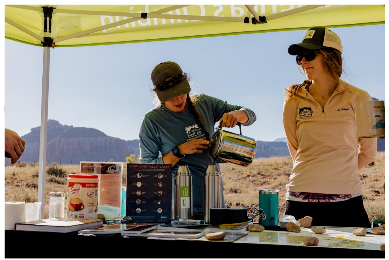
Figure 6: Climber Stewards at a Climber Coffee event in Bears Ears NM.

The Climber Steward program is a new and exciting partnership with the Access Fund which started in 2021. During the climbing season, two Climber Stewards live and work in Indian Creek, interacting with their fellow climbers and providing information about resource protection. One particularly successful aspect of this partnership is weekly "Climber Coffee" events, where the Climber Stewards are joined by BLM staff to answer climber's questions and provide education about topics such as raptor avoidance areas, cultural site protection, and Leave No Trace camping in Indian Creek.