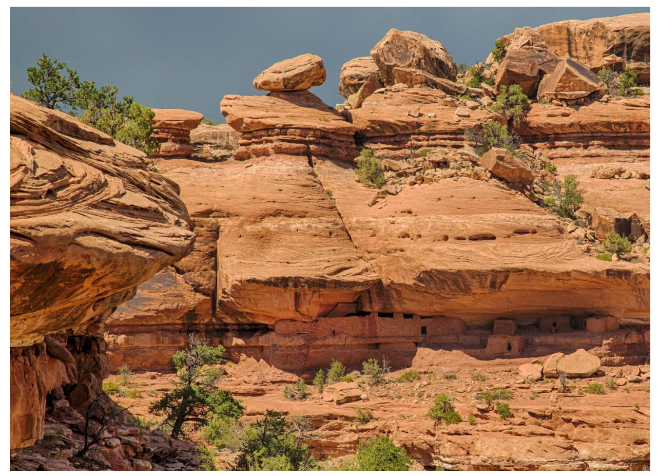
Figure 3: Cliff dwellings located within Bears Ears NM.

Fiscal Year 2021 was a successful and busy year for Bears Ears National Monument (BENM). Despite the challenges of increased visitation, COVID-19, and the ongoing monument review, the BLM at BENM found unique and creative solutions to continue positive forward momentum. It was a year spent leveraging partnerships to engage Native youth, develop virtual experiences and education opportunities, and increase our contact and visibility with visitors at BENM. Several high-profile visits also took place, offering an opportunity to communicate the on-the-ground needs of the monument.