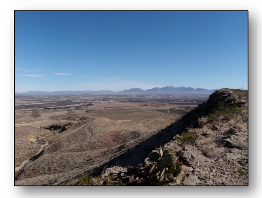
Figure 3. Northeast PTNM boundary looking toward the Organ Mountains-Desert Peaks National Monument.

Wilderness monitoring and patrolling by staff has shown increased use off the Permian Reef Road in the northwest portion of the Robledo Mountains Wilderness Area. The area is a popular camping spot where vehicles will park and build campfire rings. During patrolling, staff have broken up fire rings and collected trash as well as ensure that Wilderness boundary signage was still in place.