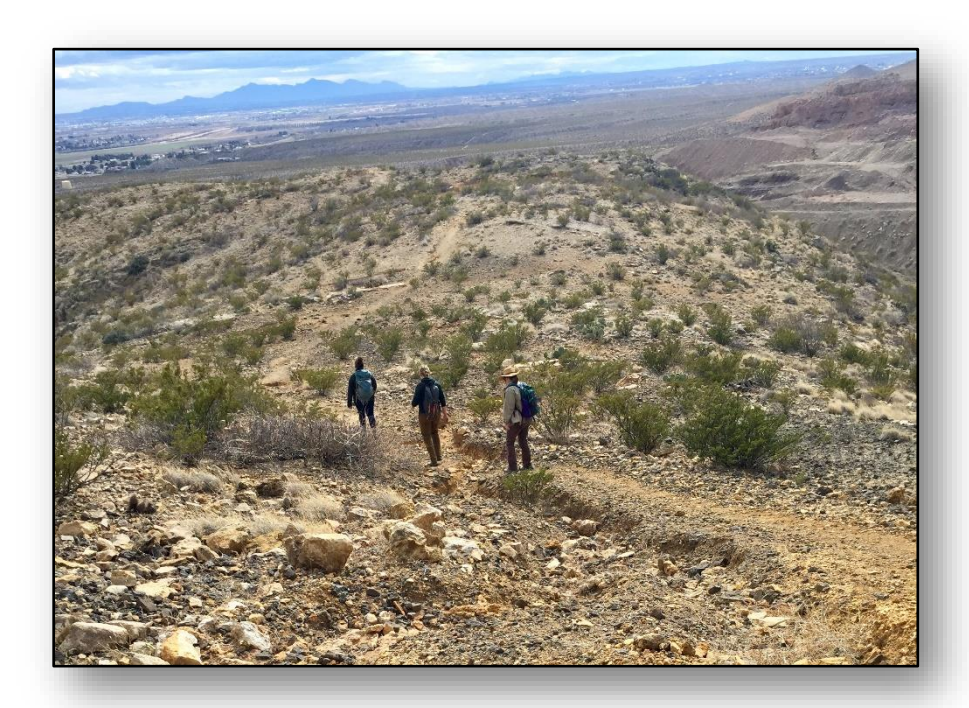
Figure 4. Hikers on the Ridgeline Trail. BLM Photo.

Throughout 2021, OMDPNM continued to offer educational and interpretive resources on public lands by sharing video and written content on social media. During patrol duties, park rangers continued to search for opportunities to educate the public on outdoor ethics, regulations, upcoming events, volunteer opportunities, and the natural cultural, and recreational resources of the area.