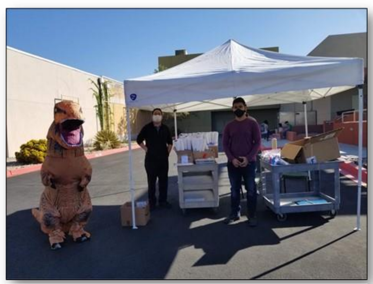
Figure 5. Volunteers at the Las Cruces Museum of Nature and Science are ready to pass out National Fossil Day activity bags in October 2020.

For the National Fossil Day event in October 2020, we partnered with Las Cruces Museum of Nature and Science. To honor National Fossil Day BLM gave the Museum magnets, posters, BLM Dinosaur coloring posters, Junior Ranger books and wooden badges to give out to the public. The Museum then added these supplies to activity-bags that parents could pick up via a drive-through kiosk. All 100 prepared bags were shared with the public.