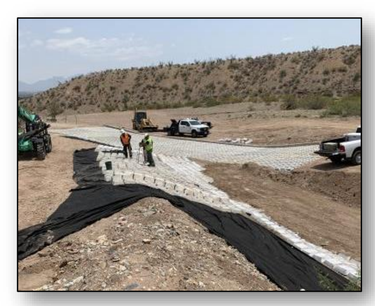
Figure 2. Las Cruces District Office staff install articulating mats as portion of road improvement project at PTNM.

The Las Cruces District Office Operations Division completed extensive work on the access road to PTNM as part of the Great American Outdoors Act. Permian Tracks Road is the developed access road for Prehistoric Trackways National Monument that received an estimated total visitation of 46,238 visitors in fiscal year 2021. This access road connects the public to 23 miles of primitive roads and 15 miles of non-motorized trails and provides access to the Discovery Site trailhead. The Permian Trackways Road repair project ($189,000) identified safety issues with the primary access road leading into the Monument creating opportunities for viewing trackway fossils, hiking, horseback riding, and off-highway vehicle driving. The project reconstructed an aggregated road surface and arroyo crossing ensuring better public access by passenger vehicles and school buses.