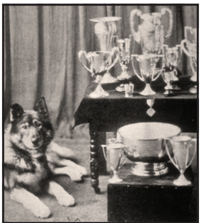
Togo, the famous lead dog for Leonhard Seppala's dog team on the Serum Run, with trophies awarded for saving Nome, Alaska.

In the winter of 1925, a deadly outbreak of diphtheria struck fear in the hearts of Nome residents. There was not enough serum to inoculate everyone and winter ice had closed the port city from the outside world. Serum from Anchorage was rushed by train to Nenana. Twenty of Alaska's best mushers and their sled dog teams relayed the serum 674 miles from Nenana to Nome in less than five and one-half days!