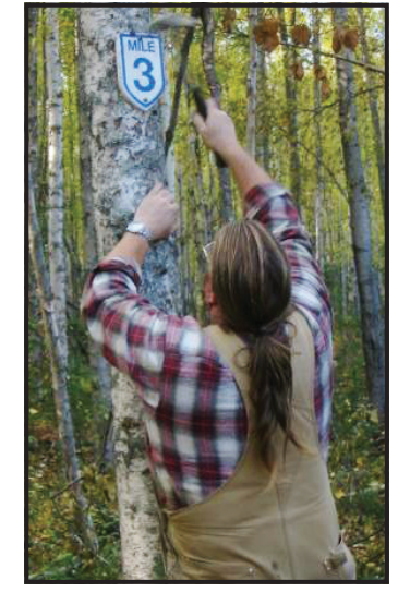
Volunteer working on the trail outside of Knik, Alaska.

Most of the historic Iditarod Trail is located on public lands managed by the State of Alaska or federal agencies (although some segments pass over private lands). No one entity manages the entire historic trail – management is guided by a cooperative plan adopted by state and federal agencies in the mid-1980s. The federal Bureau of Land Management coordinates cooperative management of the trail and is the primary point of contact for matters involving the entire trail.