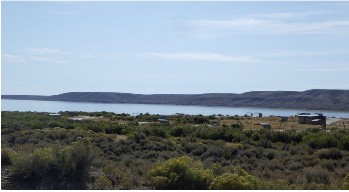
Fontenelle Creek Campground