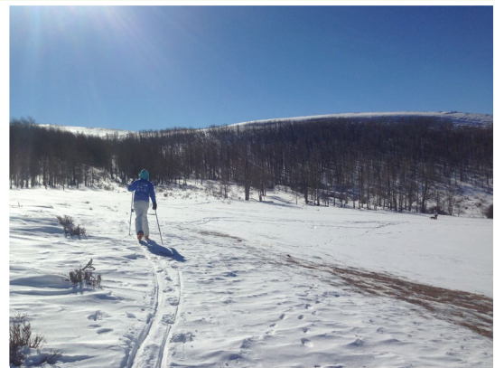
Skier using the Viva Naughton trail near Kemmerer

The Kemmerer Field Office Recreation Program has maintained Cross Country Ski trails both in the town of Kemmerer and approximately 15 miles north of the town near Viva Naughton Reservoir. These trails provide the local community and visitors with winter recreation opportunities of varying difficulty and terrain. Trails accommodate various users, allowing them to engage with their public lands meaningfully.