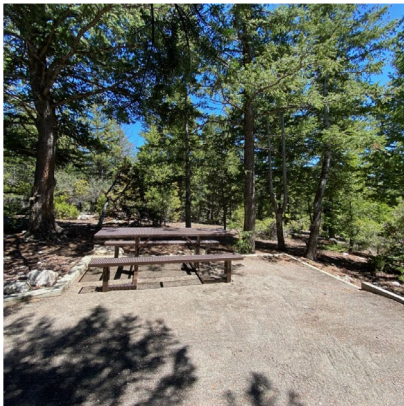
Newly installed accessible picnic table.

Five Springs Falls Campground provides an excellent opportunity for camping, hiking, picnicking, and sightseeing. This site provides breath taking views of northern Bighorn Basin with a panoramic view of the Bighorn, Pryor, and Absaroka Mountains. The elevation ranges from 6,520 feet at the campground to 7,240 feet at the forest boundary. In FY 2021, the Cody Field Office used recreation fees ($9,740.41) to install new accessible picnic tables and fire rings throughout the campground.