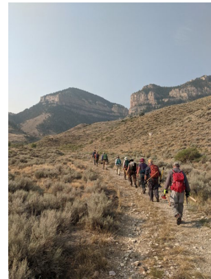
AHS volunteers start their trek up Sheep Mountain

After a week of digging, lopping, scraping, and smoothing, the Sheep Mountain Trail west of Cody is safer for hikers and horseback riders. Eight trail stewards on an American Hiking Society (AHS) "Volunteer Vacation" worked with the Cody Field Office to make much-needed improvements to this challenging trail. The Cody Field Office used recreation fees ($7,872.47) to provide initial supplies and tools. These items will be used again to host future AHS trail crew projects.