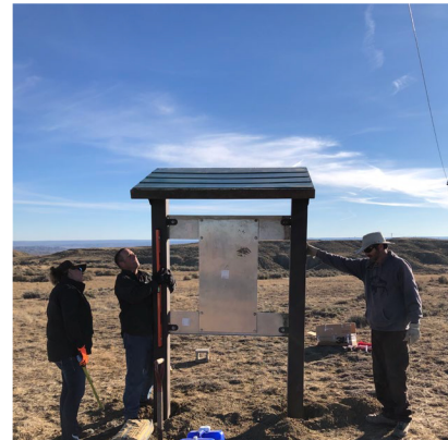
Putting the kiosk frame-up

Some of the largest parcels of BLM-administered surface within the Buffalo Field Office are within the Interstate 90 Travel Management Area. Due to the area's popularity during hunting season, the Buffalo Field Office installed three information kiosks purchased for $5,288.29 within the Interstate 90 Travel Management Area. These kiosks are located south of the interstate at key points. Each kiosk includes information about Tread Lightly! and a map and office contact info.