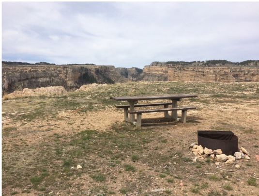
Picnic table at Outlaw Cave Campground

The Outlaw Cave Campground, a first-come, first-served primitive campground, sits at the top of the Middle Fork Powder River Canyon, offering stunning views and a trail to the river. The tables at the Outlaw Cave Campground had been in need of repair and replacement for several years. In FY21, the Buffalo Field Office purchased and painted 25 boards for picnic tables and benches for picnic table repair ($1060.37). This project will be completed when the recreation area opens in April.