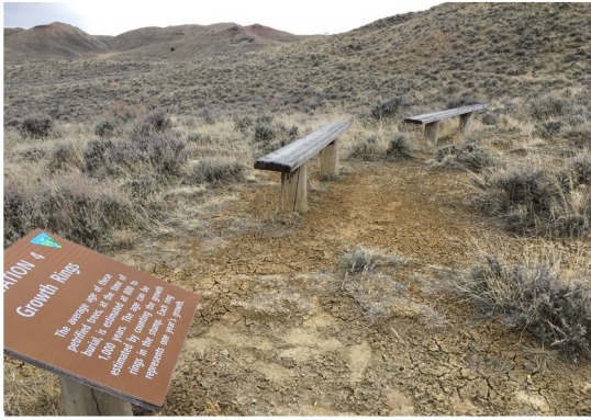
Hiking trail with interpretive sign and benches