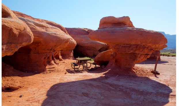
Plans include stabilizing eroding campsites at Hamburger Rock

The Monticello Field Office and BENM will continue to spend most fee dollars (approximately $600,000) to support labor costs for support staff, including Archeologists, Park Rangers, Law Enforcement Officers, Collections staff, and staffing of permit phones and remote Ranger Stations. These labor costs support interpretation, education, patrolling, monitoring of sensitive resources, and maintenance of facilities. In FY 22 and beyond, the Office plans to fund an agreement for a 3D recording and tour of the Moon House archaeological site at the cost of $74,000.