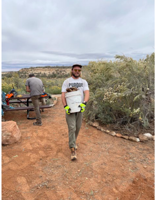
Volunteers level ground and rock line paths

BLM Rangers at the Kane Gulch Ranger Station serve visitors to Cedar Mesa by issuing permits, providing safety information, and educating them about protecting fragile cultural resources within the Bears Ears National Monument (BENM). When Ranger Station operations moved outdoors in 2021 in response to the pandemic, the BLM Park Rangers worked with Sierra Club volunteers to expand and improve a small existing outdoor seating area for visitors to review maps and permit information before setting out.