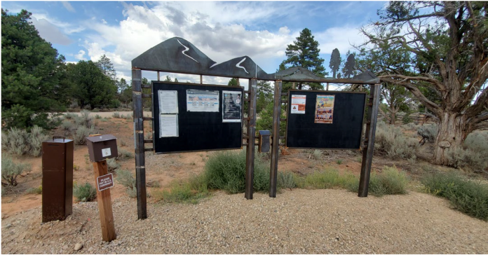
Ponderosa Grove Campground Entrance Kiosk