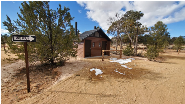
New toilet facility at Ponderosa Grove Campground

Under vendor contract, fees generated at the Ponderosa Grove campground were used to fund routine cleaning and scheduled pump-outs of vault toilet facilities at the campground. Clean facilities help support public health and safety management goals and help protect resources.