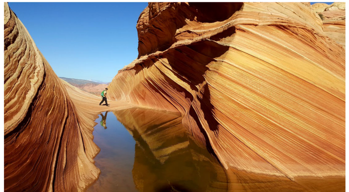
Park Ranger on patrol at Coyote Buttes SRMA

Through an agreement with Southern Utah University, Kanab Field Office was able to host several internships during FY21. Interns and staff supported by recreation fee revenue provide valuable public services such as safety patrols, site maintenance, issuance of permits, and visitor contacts/outreach.