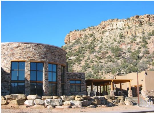
Escalante Visitor Center

During FY21, GSENM focused recreation fee revenue on labor for interpretation and educational outreach, processing special recreation permits, and conducting annual building maintenance. GSENM relied heavily on recreation fee revenue to pay for labor and operations at high-use recreation sites.