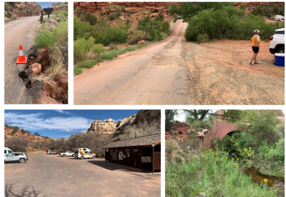
Calf Creek Road Repair

In FY21, the Escalante, Utah region experienced two flood events causing multiple facility issues at the Calf Creek Recreation site. One weather event undercut the access road creating the potential for road failure and a public health and safety issue. Recreation fee revenue and cooperation with a neighboring BLM district supported road stabilization and preserved recreational access.