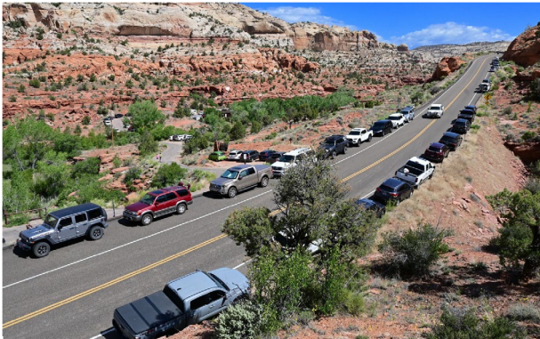
Calf Creek Recreation Area