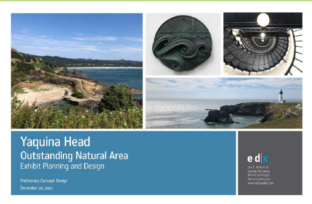
Cover page from draft Exhibit Design Plan

The YHONA Interpretive Center features exhibits for visitors to learn more about the site and its history. The center's original interpretive plan focused on human history while making natural history a secondary theme. YHONA reinvested $15,000 of recreation revenues for an independent exhibit assessment and then contracted the development of an exhibit design plan with updated interpretative themes. The primary goals of the exhibit updates are to reflect new perspectives and help the site be more inclusive to all visitors