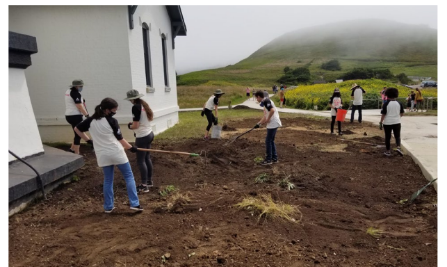
Corvallis Youth Crew; revegetation near the lighthouse