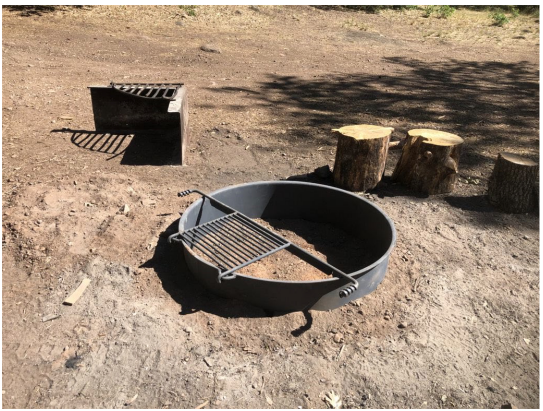
Freshly installed new campfire ring

Campfire grates at the South Gerber Campground were old and out of date. With help from many BLM employees, all campfire grates were replaced in a single day. The Klamath Falls Field Office used Deferred Maintenance funds to purchase the new campfire rings, and its recreation fee revenues funded some of the labor for the staff to replace them. Campground guests now have campfire rings with adjustable grates, which are more suitable for cooking and improved from a fire safety perspective.