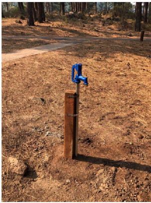
Frost-free hydrant at Topsy Campground

The Klamath Falls Field Office has a fair amount of aging infrastructure at its fee sites, and sometimes things need to be repaired or replaced ahead of the deferred maintenance cycle. The BLM utilized a combination of recreation fee revenues and deferred maintenance funding to support the labor costs and purchases needed to replace broken and leaking spigots at the Topsy Campground.