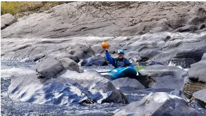
River Ranger removing litter from the Rogue

The Rogue River Ranger crew conducted several clean-up efforts on the river in Fiscal Year (FY) 2021. They participated in the annual Rogue River clean-up, working with Josephine County to support the effort. The river rangers conduct a pumpkin sweep every autumn, removing the many pumpkins that tend to find their way into the river after the fall holiday season. The river rangers also helped with invasive species removal, turtle surveys, fuel reduction projects, emergency communications, raft recovery, and trail maintenance.