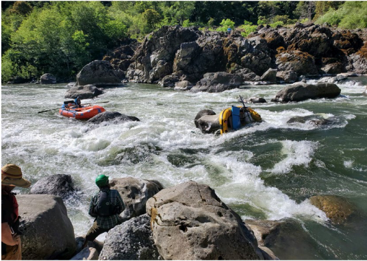
River Rangers during a raft recovery