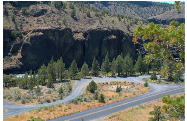
View of Chimney Rock Campground

The BLM’s Wildland Fire staff are not only great at fighting a fire, but they also make great park rangers! Funding was provided to allow two firefighters to work in recreation during the high-use season. They learned how to maintain campgrounds and day-use sites. This opportunity provided an excellent experience for cross-program collaboration and support.