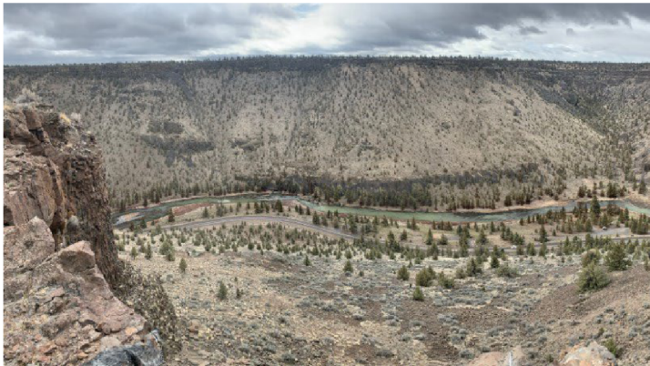
Peering down onto Lone Pine Campground

While driving the Lower Crooked River Backcountry Byway, you will observe several campgrounds and day-use sites along the Lower Crooked Wild & Scenic River. Many of the picnic tables located at these sites are weathered and ready for replacement. In 2021, the Deschutes Field Office purchased several new metal picnic tables to upgrade those most needing replacements.