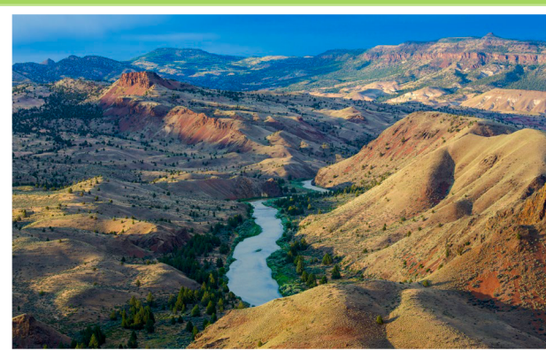
View from above of the John Day River basin