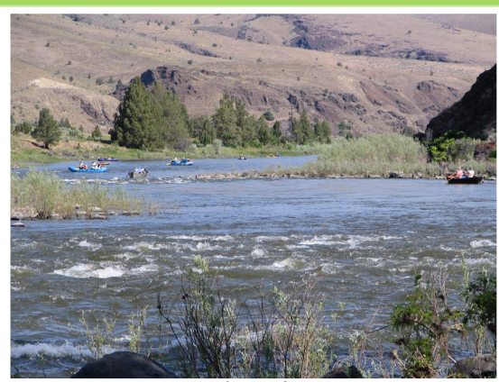
Boaters on the John Day River

In Fiscal Year 2021, the Central Oregon Field Office expended $3,878.23 in recreation fee revenue to support the administration of both the John Day River boater permits and the processing of Special Recreation Permits (SRP). In addition, staff answered calls and emails and made public contacts to continue supporting the public as demand for boater permits increased.