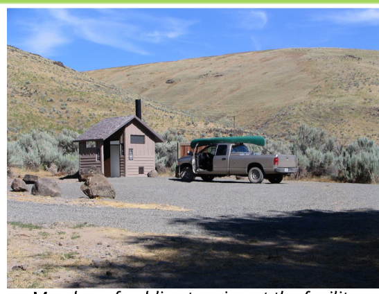
Member of public stopping at the facility

The John Day Wild and Scenic River, located in Central Oregon, attracts boaters of all skill levels. The BLM reinvested $13,462.63 in recreation revenues in Fiscal Year 2021to enhance the visitor experiences on the river by maintaining facilities, launches, and take-outs. Both the river and launch points were consistently patrolled by BLM employees and through a partnership with the Oregon State Police.