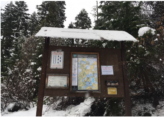
Example Bulletin Board