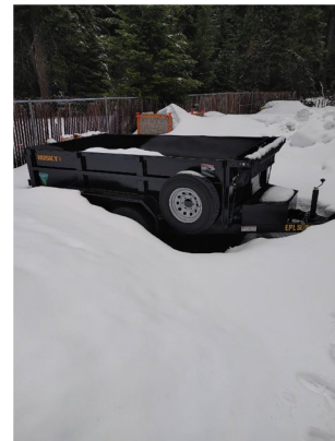
New Dump Bed Trailer

Several recent projects at the Hyatt Lake Recreation Area have required the loading and removing of large amounts of material. To facilitate this work, a dump bed trailer was purchased. The dump bed trailer has proven to be an invaluable tool that reduces the work required for unloading material and improves employee safety. So far, it has been used to replace gravel at campsites and to remove cut rounds of fallen hazard trees that will be split for camp firewood.