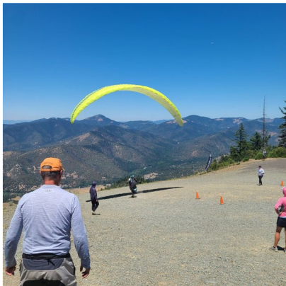
Applegate Open Participants

The Applegate Open is a 2-day hang gliding, and paragliding event held at Woodrat Mountain and is authorized annually under a special recreation permit (SRP). Event monitoring was conducted to ensure compliance with SRP stipulations and the National Environmental Policy Act (NEPA) analysis.