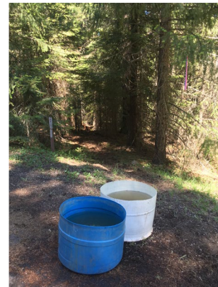
Water Location Monitoring

The Pacific Crest Endurance Ride (PCER) is a 35, 55, and 75-mile endurance horse ride event held over two days that utilizes portions of roads and trails in the Cascade Siskiyou National Monument (CSNM) and is authorized annually under an SRP. Event monitoring was conducted to ensure compliance with SRP stipulations and the NEPA analysis.