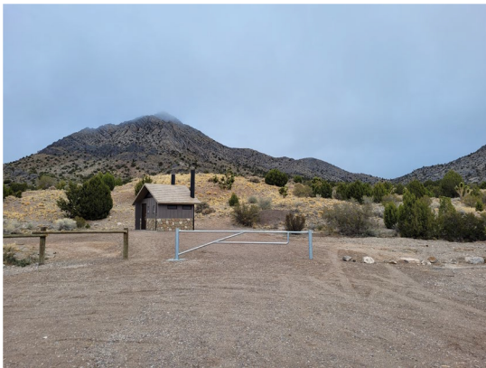
Trilobite Toilet Installation

The Oak Springs Trilobite Site is east of Caliente, NV. This fascinating area is laden with fossil remains of six types of trilobites in the shale deposits near Oak Springs Summit. Improvements to recreation facilities enhanced the visitor experience. They lengthened the stay for the local schools by adding the new toilet ($107,068 FY21). The double vault toilet is now available onsite for all recreating visitors.