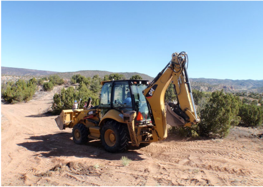
Heavy equipment operator for Santa Cruz Lake