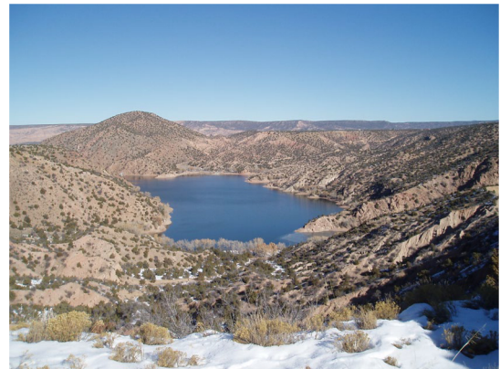
Overview of Santa Cruz Lake

The field office purchased a Utility Terrain Vehicle to patrol and conduct maintenance at Santa Cruz Lake on primitive routes. The cost of the Utility Terrain Vehicle was $25,000.