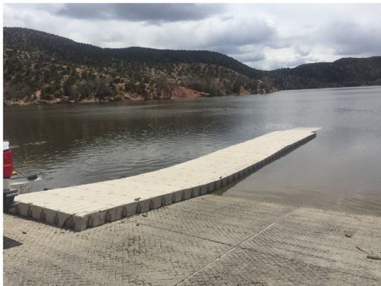
Boat Ramp at Santa Cruz Lake

The field office restored and maintained a motorboat for Santa Cruz Lake to conduct visitor contacts on the lake and reach remote areas for trash clean-up and clearing of branches and obstacles. The cost of maintenance and staff training was $4,500.