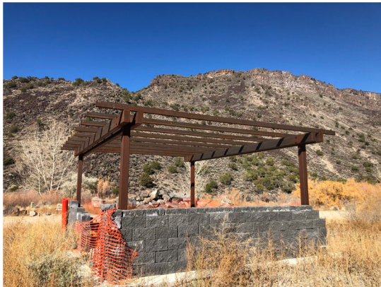
Construction of new shelter at Petaca Campground

With assistance from various BLM New Mexico construction and heavy equipment crewmembers, the agency built a prototype to explore an option to blend well with visual resources while balancing low maintenance facilities. The cost of the crew working for a week at the Petaca Campground was $23,488, with the campground being completely renovated.