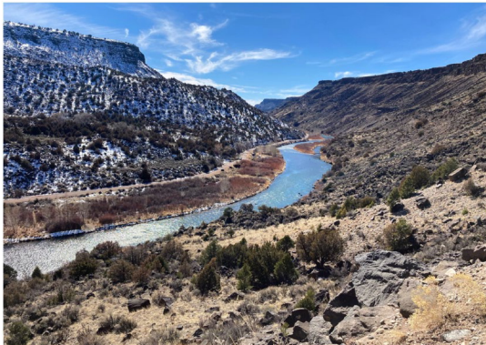
A volunteer event is planned with climbers and the Access Fund for Dead Cholla climbing access route

There are no planned projects with use of returned fees for 2022. This is an opportunity to potentially accumulate carryover for projects in 2023.