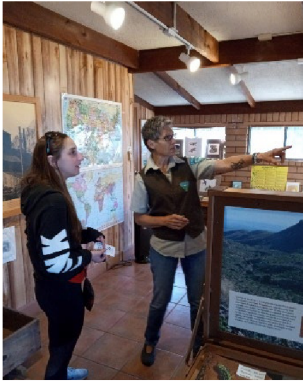
Volunteer helps visitor at VC