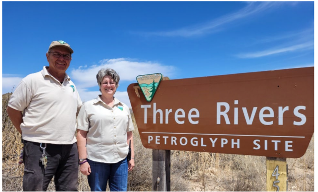
Site Hosts stand by the entrance to Three Rivers

Wandering the trails at Three Rivers can be overwhelming, with the over 21,000 petroglyphs spread over basalt rocks and left by the Jornada Mogollon people. These spectacular public resources need protection. The Las Cruces District Office utilizes 1232 funds to reimburse volunteers for managing the site, caring for the campground, preserving cultural resources, and answering questions from the public in our visitor center ($10,428).