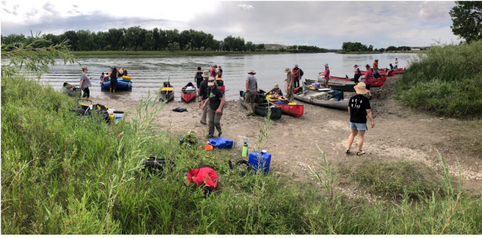
Visitors prepare to launch at Coal Banks Landing

The BLM UMRBNM will have an Outcomes Focused Management (OFM) study conducted throughout 2022. The OFM study will enable the BLM UMRBNM to determine the desired experiences and benefits from recreation participants, recreation-tourism providers, and communities. The BLM UMRBNM will be creating and designing all new kiosk displays at the James Kipp Recreation Area and installing new informational/directional signs. The BLM will be collaborating with multiple other federal and state agencies to produce a Montana-specific river education video.