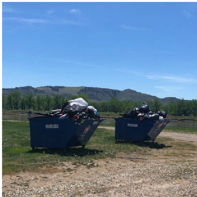
Trash collection services

The BLM Upper Missouri River Breaks National Monument (UMRBNM) has three developed campgrounds that provide boat launching facilities for the Upper Missouri National Wild and Scenic River (UMNWSR). The multiple dumpsters available at each campground give highly desirable service to the public. A total of $20,259 was used from FLREA fees collected at the monument campgrounds for trash collection services in the fiscal year 2021.