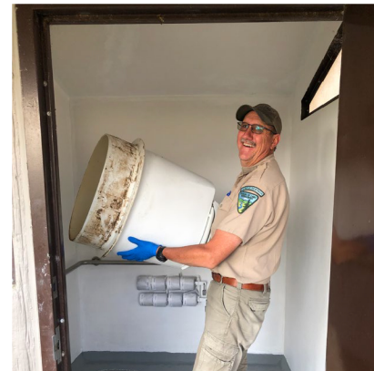
A Park Ranger repairs a vault toilet

The BLM Upper Missouri River Breaks National Monument (UMRBNM) hired six (6) seasonal Park Rangers during the summer of 2021 using $24,301.56 of FLREA fees collected in the monument. The Park Rangers performed a variety of visitor services, such as being a friendly and knowledgeable source of information for the public and helping people understand the rules and regulations of the monument (e.g., campfire restrictions and the need to carry a waste containment system while on the river).