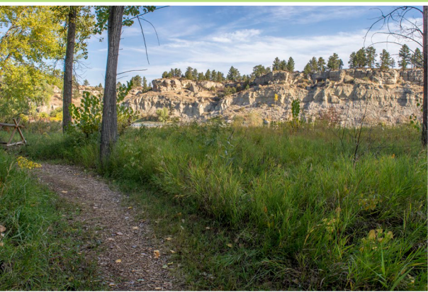
The trail next to Yellowstone River, PPNM

One mile of new trails was built at PPNM in FY 21. $3,540.42 (16X) was used to fund seasonal labor (three park rangers) to complete trail clearing, trail post-installation, and trail bench placement on the new trail system. This project expanded the trail system utilized by visitors to the National Monument and Area of Critical Environmental Concern. It also maintains the desired environmental outcomes and improves visitors' quality of experience while retaining the distinctive natural landscape features for which the site was designated.