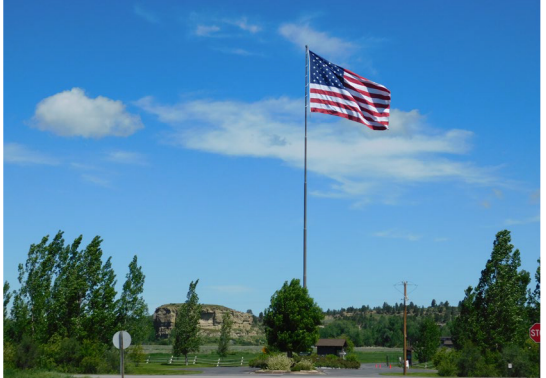
The flag pole at the entrance to PPNM

Flagpole and gate post paining (front entrance) PPNM will be completed in 2022 (spring/summer). 120'-foot flagpole, at one time, it was the highest in the State of Montana. The steel flagpole was installed in 2008 and experienced some weathering and wear and tear. Work will include prepping and painting the flagpole, various gate posts, and a vehicle barrier. It will also include installing a new cable and truck (top pulley) on the flagpole. Funding breakdown: $10,076.82 16X $ 4388.18 17X