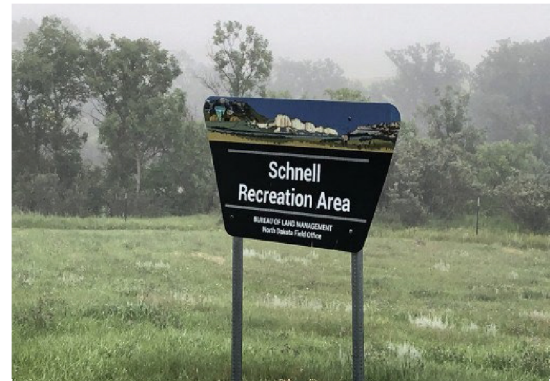
Schnell Recreation Area Sign

The Schnell Recreation Area near Richardton, ND has many opportunities, including three miles of hiking trails and six primitive campsites. Dispersed primitive tent camping is allowed on the property except along an established 1.5-mile nature trail. Schnell is a non-motorized area with good opportunities for wildlife viewing, nature photography, hiking, mountain biking, horseback riding, cross-country skiing, camping, and environmental education.