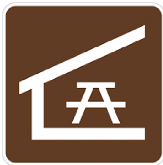
Picnic Shelter Symbol

The North Dakota Field Office plans to use fee collection monies from FY21 and previous years to complete the installation of picnic shelters at the Schnell Recreation Area in the next 2-to 4 years. All six camping locations are rustic & nestled within rolling hills giving each guest enough room to stretch out, breathe and enjoy great family time.