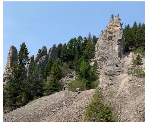
Limestone Cliffs Rock Climbing

Limestone Cliffs Special Recreation Management Area comprises a unique geological feature that supports rock climbing and educational field trips by local schools. In FY2021, the BLM MiFO partnered with a local rock climbing club to maintain the trails to the rock climbing areas. Fee revenue was used to buy materials for the trail maintenance.