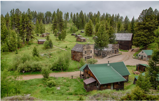
Garnet Ghost Town

Garnet Ghost town receives over 30,000 visitors from mid-May through mid-October. With decreasing budgets and increasing visitation, and increasing length of the visitation season, the majority of fee revenue will be used to pay for seasonal labor, volunteer reimbursement, equipment, and supplies in FY2022. Trail maintenance is also proposed at Limestone Cliffs SRMA again this Fiscal Year.