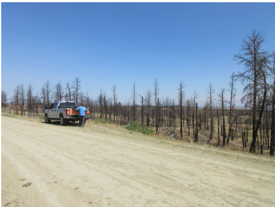
BLM seasonal employee monitors MCFO public lands

The Miles City Field Office (MCFO) annually administers 40-50 permits. In 2021 MCFO received approval to hire a Career Seasonal employee for SRP administration. BLM's ability to carry over fees for multiple years was vital in getting this position. There is currently only one Outdoor Recreation Planner. The MCFO can better serve the public, permittees, and new SRP applicants with this additional position. The MCFO spent $17,000 from "carryover" funds, which was invaluable.