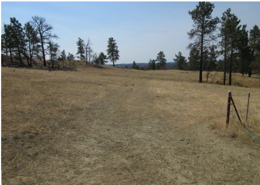
Unauthorized off-road tracks found during hunter patrol monitoring