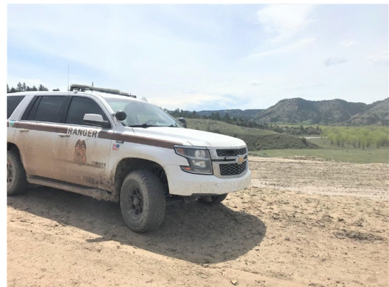
BLM Law Enforcement patrols public lands

The MCFO funds 2-3 career, seasonal employees for one to two months and a law enforcement employee during hunting season. In 2021 the MCFO spent $18,000 of SRP revenue for the following duties: