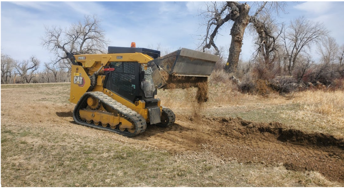
Staff uses heavy equipment to spread gravel