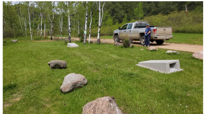
Concrete cornhole boards installed

Two sets of concrete cornhole boards were installed at Camp Creek Recreation Area. Recreation fees were used to purchase and install two sets of concrete cornhole board games at Buff's Picnic area and Camp Creek Campground. Bags are available for check out and use.