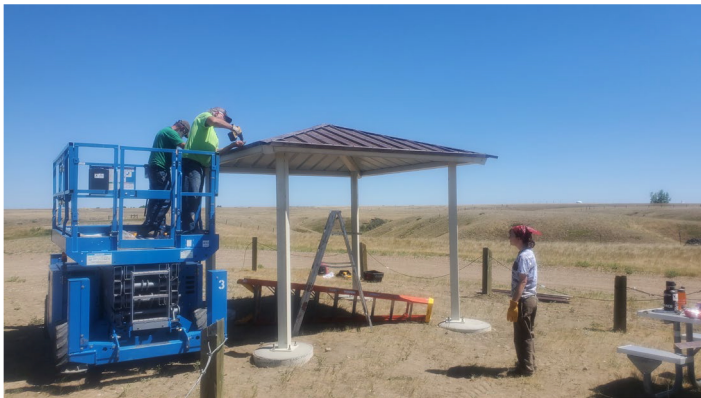
Installing picnic shelter

A metal picnic shelter is installed at the Glasgow OHV Recreation site to provide shade and shelter for users.