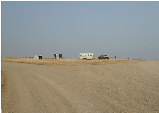
Musselshell River Breaks

The Musselshell River Breaks area is a mix of private and public land ownership. Its attractive game populations are a desirable area for the hunting outfitter industry. Evidence of human waste is noticeable at roadside pull-offs throughout the area. Through the revenue generated from special recreation permits from hunting outfitters, the Lewistown Field Office plans to install two vault toilets to promote human health and safety as no restroom facilities presently exist. This project is estimated to cost $60,000 and will also benefit the general public year-round. The Field Office has saved previous fiscal year revenue to fund this project.