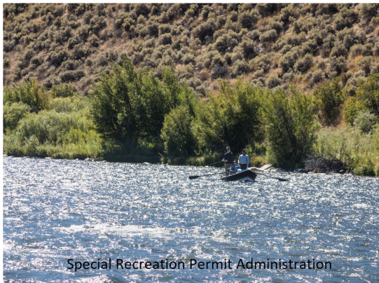
Special Recreation Permit Administration