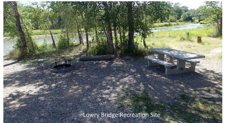
Lowry Bridge Recreation Site