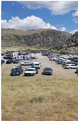
Busy Tuber Hatch at California Corner

The Madison River is a diverse environment that experiences a high visitation rate, drawing recreationists from across the country to float and fish the river. Record levels of use were experienced in 2020 and 2021. $5,785 of FLREA funds were used in FY21 to maintain a presence of BLM Law Enforcement Rangers to provide for visitor safety through daily patrols. Approximately $40k in other program funds were contributed to help fund law enforcement support costs.