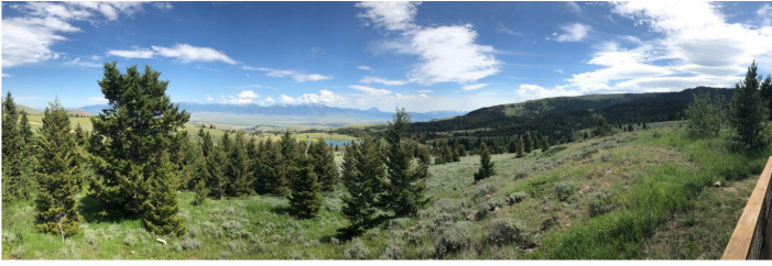
View from Axolotl Lakes Cabin