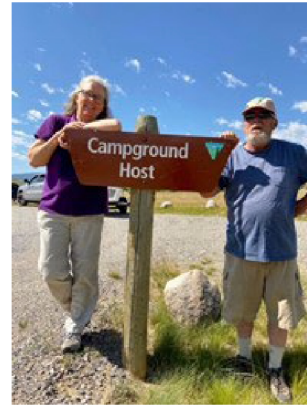
Campground Hosts at Ruby Creek

Red Mountain Campground and Ruby Creek Campground are two campgrounds on the Madison River. Each campground has a range of recreational activities with wildlife viewing, fishing, river tubing, or a camping trip with friends or family. In FY21, we used $11,016 in FLREA funds to provide campground hosts at these campgrounds. Our hosts maintained the facilities keeping the restrooms clean, answered questions, and helped wayward travelers find a place to lay their heads for the night.