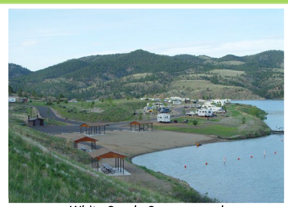
White Sandy Campground

For FY22, we will continue to support volunteer campground hosts, maintain clean facilities, continue to repair and improve the water systems of Log Gulch, White Sandy, Devil's Elbow, Holter Lake, and Clark's Bay, purchase additional signs, implement a bank stabilization project at White Sandy, move forward with roof replacement for Clark's Bay, Log Gulch, and Holter Lake campgrounds, and install Bear Boxes at Divide Bridge Campground.