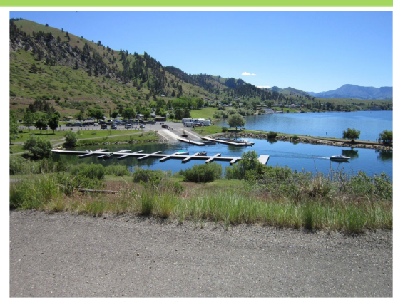
Holter Lake Campground

The Chain of Lakes experiences a high visitation rate, drawing recreationists from across the country. Activities include camping, boating(motorized/non-motorized), fishing, water skiing, hiking, scenic photography, wildlife viewing, and bird watching. Record levels of use were experienced in 2020 and 2021, and additional maintenance and repair projects were needed because of increased visitation. $37,229 of FLREA funds addressed much-needed repair and maintenance projects.