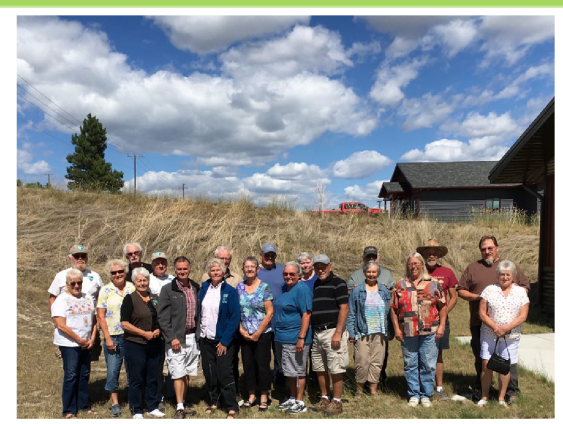
End of Season Volunteer Get Together

Recreational opportunities include wildlife viewing, fishing, boating, rafting, or camping. Divide Bridge, Carbella Recreation Area, White Sandy, Departure Point, LogGulch, Clark's Bay, Devil's Elbow, Holter Lake, and Holter Dam are campgrounds that provide access to the Big Hole and Yellowstone Rivers and Chain of Lakes area. In FY21, we used $17,983 in FLREA funds to provide campground hosts at these campgrounds; hosts maintain facilities and answer questions.