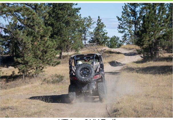
UTV on OHV Trail

We partnered with the Montana Trail Vehicle Riders Association (MTVRA) to enhance rider experience at Shepherd Ah Nei OHV Area by improving the motorized trails. MTVRA utilized grant monies to match BLM funding to improve the trail system at Shepherd Ah Nei OHV Area.