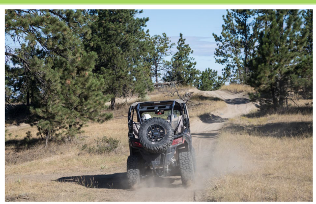
UTV out on trails

The BLM has partnered again with MTVRA to apply for additional grant funding. We are utilizing funding in 2022 to perform further maintenance on trails in the OHV Area. Carryover funds will go to help pay for the contractor.