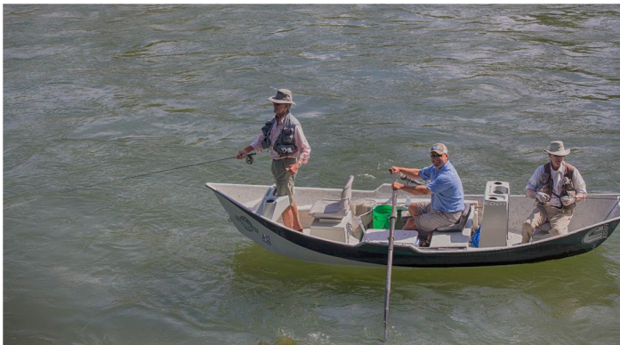
Fishing on the South Fork of the Snake River