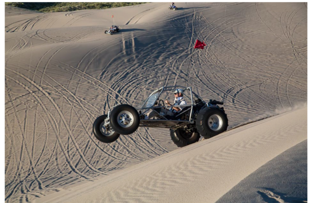
Riding in the Sand Dunes