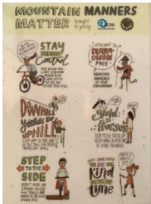
Trail Manners Poster

The International Mountain Bicycling Association assistance agreement will help support trail construction within the Wood River Valley. Funds were obligated to this agreement in FY21 and trail construction began in early FY22. Blaine County Recreation District (BCRD) Assistance Agreement is a multi-year agreement that assists with education and outreach efforts regarding trail conditions in the Wood River Valley along with assisting in maintenance of BLM trails.