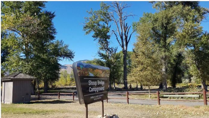
Shoup Bridge Campground

Funding was put into an existing Interagency Assistance Agreement with Federal Highways for the Shoup Bridge Campground portion of the Highway 93 South Trail Project. As part of the project, Shoup Bridge Campground will be restructured, paved and striped to create better parking for overnight campground and day users. Several large dying cottonwood trees were removed to eliminate health and safety concerns from falling branches.