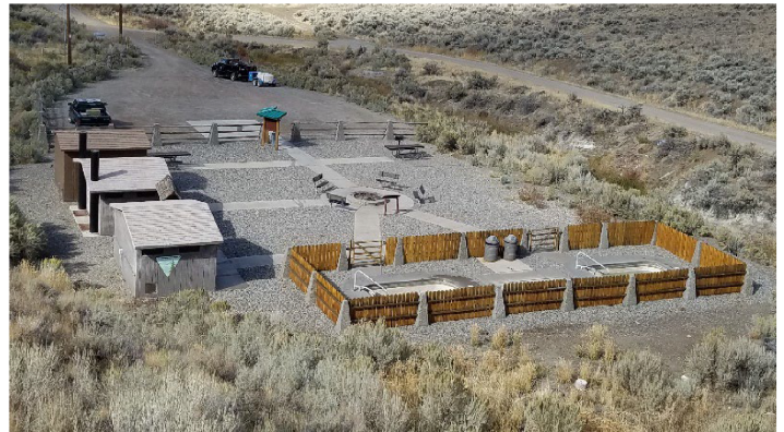
Sharkey Hot Springs

Salmon Field Office has great recreation sites. Salmon spends a majority of their fee dollars on maintenance of their sites as well as providing stipends for camp hosts. Recreation sites like Sharkey Hot Springs take a significant amount of time to keep in an acceptable condition for the public. Other sites include McFarland, Tower Rock, Williams Lake, and Morgan Bar.