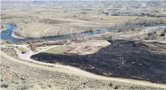
Prescribed Fire at Morgan Bar Campground

Pay for permanent and seasonal Park Ranger labor and volunteer camphost stipends. $5,000 will be used as matching funds for an Idaho Parks and Recreation Grant to install new campsite and day use facilities at Shoup Bridge Campground. Routine maintenance of fee sites and water systems. Repair leak in water system and relocate camphost electrical pedestal at Shoup Bridge Campground. The Field office has planned to carryover $5,000 to use as matching funds to apply for Idaho Parks and Recreation Grants to upgrade campsite facilities at Morgan Bar Campground in FY23.