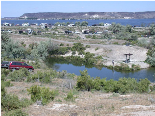
Cove Recreation Site

Cove Recreation Site is a developed campground on CJ Strike Reserve. Campground facilities include potable water, shade structures, fire rings, picnic tables, fishing docks, an RV dump station, and a small boat ramp. Drinking water is generally available during summer months. Fees were used to maintain and enhance the site throughout the year, including replacing damaged signs, graffiti removal, and upgrading camp host facilities (e.g., shade structure contract).