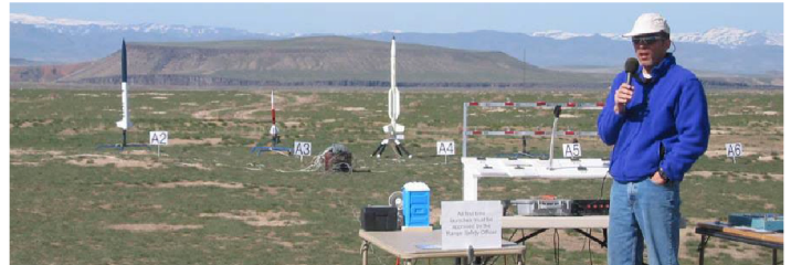
Tripoli Rocket Launching

Tripoli Idaho Rocketry (TIR) welcomes everyone who wants to experience the thrill of building and launching rockets. People from all walks of life enjoy this fun and educational hobby, which is building and flying small and large high-power rockets. High-power rockets can weigh more than 50 pounds. Launches are run with the full approval of the FAA and the BLM. The public is welcome and can watch for free. A public address system is used during launches to keep the participants and spectators well informed.