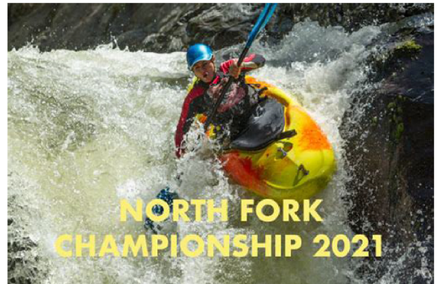
North Fork Kayak Championship

The North Fork Championship (NFC) is a whitewater kayaking extreme race located on the North Fork of the Payette River. The North Fork is one of the most well known class V rivers in the world, most notably for the extremely continuous big water. The NFC takes place in June and brings the best whitewater kayakers from around the world to race down the infamous rapid called "Jacob's Ladder". The American Canoe & Kayak named the North Fork Championship as the 2013 Event of the Year and continues to attract kayakers.