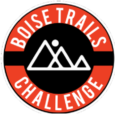
Boise Trail Challenge

Funding from SRP fees will be used to work on Boise Foothills/ Ridge to Rivers Trail System by Operations for outreach events with Backcountry Hunters & Anglers (Bennett Hills BCA), white water boaters (Payette River), and trail enthusiasts (Boise Foothills). Funds collected at Steck Park Campground will be used to reimburse camp host, maintain equipment, & replace signs. Additional Signs will be purchased for various Four Rivers Field Office Recreation Sites and implementation of soon to be approved Resource Management Plan.