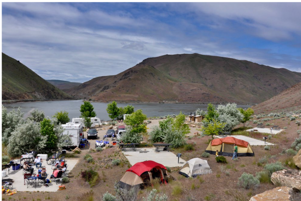
Steck Park Recreation Area

The Four Rivers Field Office installed new signs for Steck Park, Skinny Dipper, Oregon Trail, Willow Creek, and Blacks Creek Recreation Sites. Vandalism to gates and signs was repaired and graffiti was removed. The district purchased a dumptrailer in FY21 which will help the recreation program with pothole repairs in recreation site parking areas. Funds are also used for a maintenance and toilet cleaning contract.