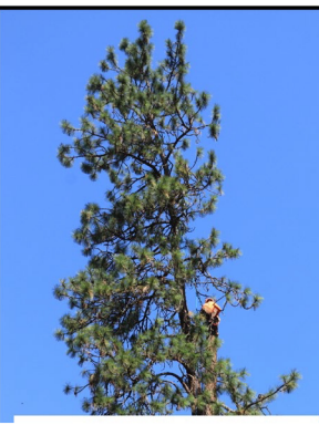
Hazard Tree Removal

Install campfire rings at dispersed recreation sites Convert three 30-amp service RV sites at Pink House Recreation Site to 50-amp service to accommodate larger RVs