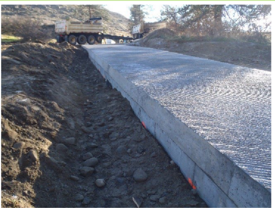
Slate Creek Boat Ramp Under Constructions

The Cottonwood Field Office manages multiple recreation sites along the Lower Salmon River. Many of these sites have boat ramps. In FY 21, the office used 1232 funds to leverage $413,000 of 1653 funding for three boat ramp improvement contracts at Lucile, Shorts Ba,r and Hammer Creek Recreation Sites. $39,999.97of 1232 funds was used to leverage $187,074.88 of 1653 funding for the Pine Bar Recreation Site Asphalt Road Improvement project.