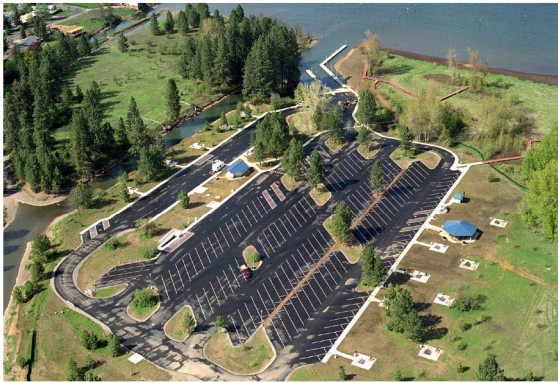
Blackwell Island Boat Launch on Lake Coeur d'Alene