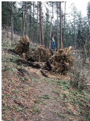
Downed Trees from Wind Storm

In January 2021, the Field Office experienced a major wind event that impacted many of the developed recreation sites and trails. Funds were spent to help assist with clean-up, debris removal, and restoration of facilities and developed trail amenities across the field office's recreation sites. The most impacted sites were Mineral Ridge Scenic Area and Wallace Forest Conservation Area.