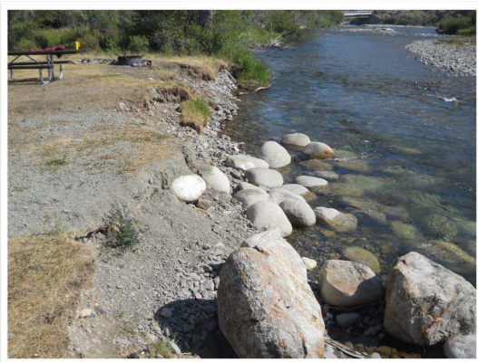
Little Boulder Erosion

This campground, adjacent to the East Fork Salmon River, is often used as a staging area for the Boulder-White Clouds wilderness. Conceptual design contract was awarded for a bank stabilization project. Little Boulder has been experiencing erosion from the East Fork of the Salmon River, which threatens to destroy the campground infrastructure and increases the potential recreation impacts to important salmon and steelhead spawning habitat.