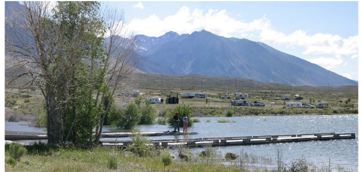
Joe T. Fallini Campground at Mackay Reservoir

Five volunteer Campground Hosts maintain facilities and provide visitor services at Challis's campgrounds from May to September. The hosts are provided a reimbursed per diem and personal vehicle fuel per mileage for government related work. Recreation infrastructure repairs and maintenance were completed, including electrical work, vault toilet pumping, and campground road improvements. Various campground and building supplies were purchased to assist in recreation maintenance.