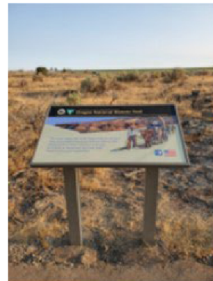
Interpretive Panel for Oregon NSHT

Over 100 years ago, emigrants on the Oregon Trail passed through what is now the Milner Historic Recreation Area, creating ruts as they traveled through the soft soil of the area. The historic recreation area preserves these still visible Oregon Trail ruts. Centered within the historic recreation area is a 1.3-mile paved ADA walking path that follows the historic ruts. Visitors can find interpretive panels and a hiking trail that leads to some of the Oregon Trail ruts.