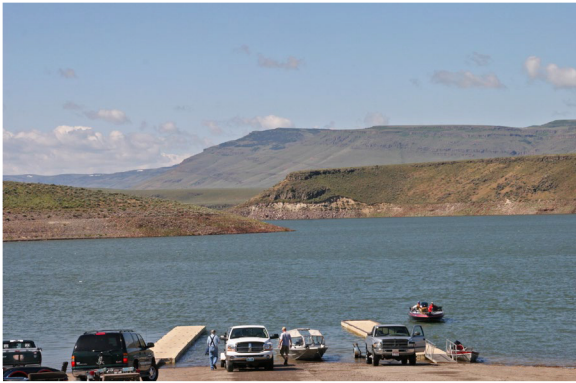
Launching Boats at Lud Drexler Recreation Site

Funds will be used to replace the RV dump station at Lud Drexler Park. With increased construction costs and inflation since the estimate was done in early 2021, the final costs could be $30,300 or even higher by the time the contract is done.