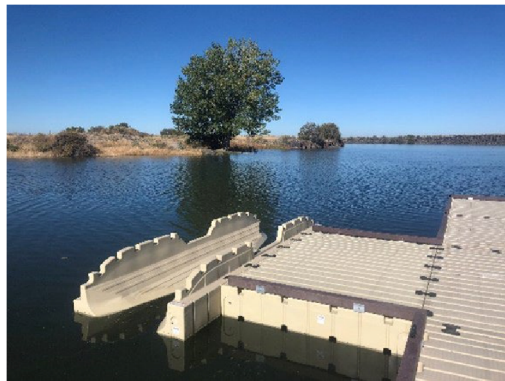
New Kayak Launch at Milner

Fee dollars provided funds to help the recreation program to purchase various supplies for cleaning and repairs at fee sites, and: • Funds were spent on routine and annual services such as garbage dumpster service. • Purchased various supplies to perform deferred maintenance of facilities at both fee sites. • Improved visitor services with a new kayak launch.