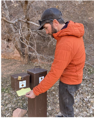
BLM Park Ranger Inspects A Redesigned Fee Envelope