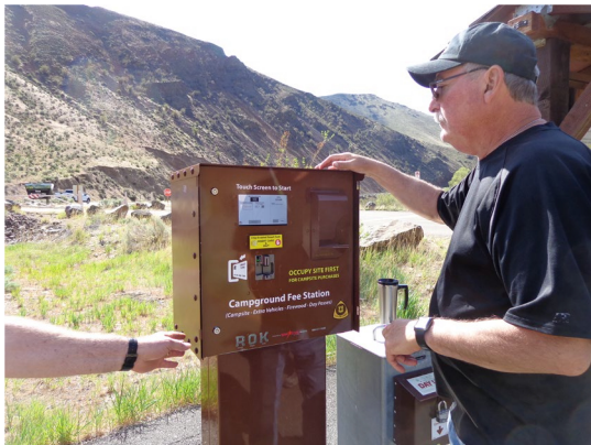
BLM Park Rangers inspect a solar powered kiosk

In March 2021, BLM-Headquarters Division of Recreation and Visitor Services (HQ430) began discussions with the BLM Wenatchee Field Office (WFO) to pilot a new type of recreation fee collection system; a Remote Off-grid Kiosk (ROK). This device, allows visitors to pay recreation fees, using credit or debit cards. Transactions can occur even if cell or WiFi connection is not available. With funding support from HQ430 ($10,000), the WFO installed a ROK at Roza Recreation Site in the Yakima River Canyon of central Washington on June 14, 2021.