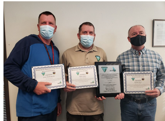
BLM staff enjoy a moment of recognition for their support of the RAPTOR pilot system

During FY21, HQ430 used $76,900 of collected recreation fees to help launch the release of the RAPTOR (Recreation and Permit Tracking Online Reporting) system. The system successfully issued 38 Special Recreation Permits (SRPs) during fiscal year 2021. This paperless system streamlines the permitting process by allowing the public to apply, agree to, pay for, and renew SRPs online. Authorized Officers and specialists have authoring and editing access to tailor the permits to meet the needs of the local office. The new RAPTOR system makes this process simpler, faster, and more standardized.