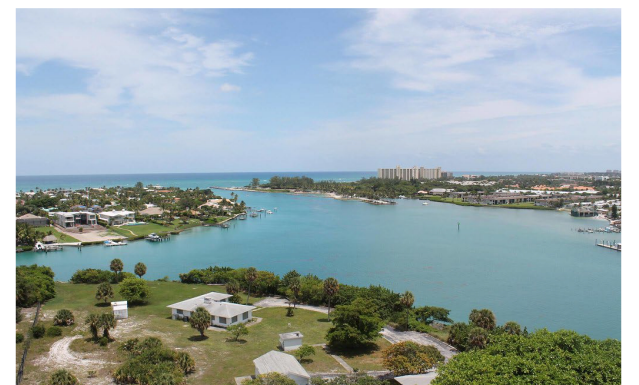
Aerial view of JILONA