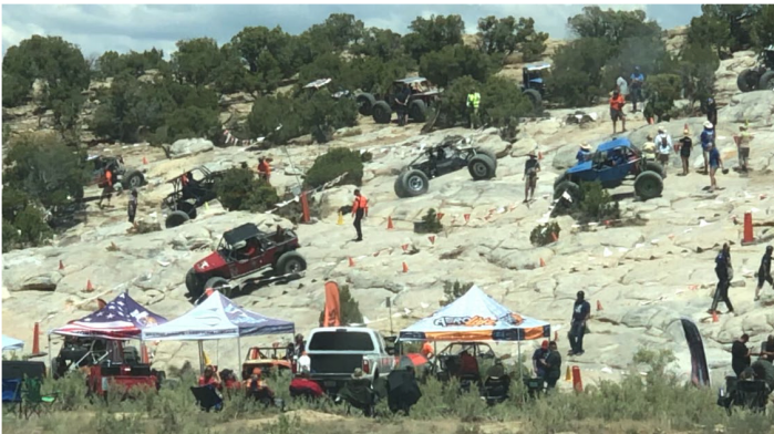
Comptitive Rock Crawling Event

OHV riders travel far and wide to compete in the Rangely Rock Crawl. The routes range from easy todifficult, and the vast terrain of rock is well designed for trails system for various off-road vehicles. The competitive rockcrawl events bring in at least fifty competitors, and hundreds of visitors thatcamp and compete each year. Southwest of Rangely is the only designated natural rock crawling park in Colorado; more than 560 acres of natural terrain was developed and designated by the BLM as a four-wheel-drive park.