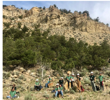
RMYC Connecting the Anderson Gulch Loop Trail

One of our most popular, unique recreation sites is the Meeker Trails System, designed by an environmental assessment masterplan in 2015 with the BLM White River Field Office and community agencies. Over 11 miles of single-track trails have been constructed open to hiking and mountain biking. The newest addition was made in the summer of 2021, the Anderson Gulch-Ute Park Trail Connector loop. All five trailheads and parking lots offering access to the trail system are connected full circuit.