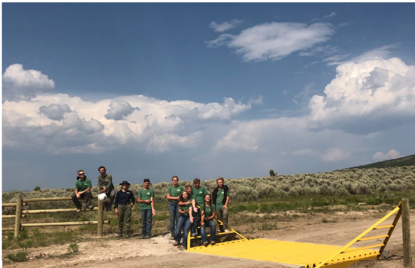
L07 Open Area

Recreation and visitor staff process, administer, and monitor our Special Recreation Permit program, with nearly 70 permits issued within the field office. Staff will continue to assess and monitor inventory within the field office, route conditions, dispersed camping sites, assess any potential resource damage, trails, open areas, wilderness units, and lands with wilderness characteristics units. Recreation and visitor staff continue working with the community, partnerships, local groups, and volunteers for public educational outreach and building strong work relationships with our valuable partners.