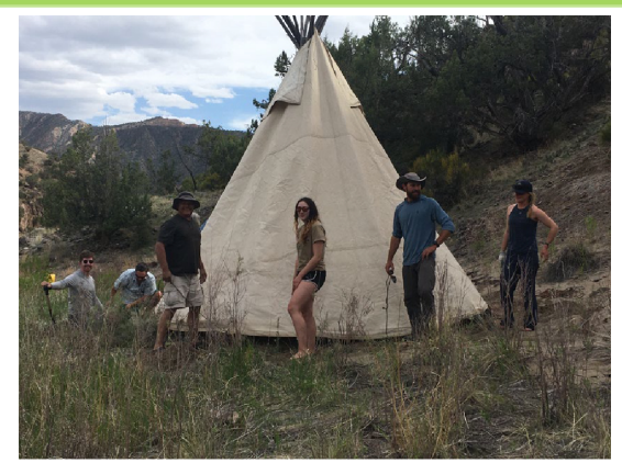
Rangers and Volunteers Set Up the Ranger Station

Hired two seasonal River Rangers to patrol the Gunnison Gorge Wilderness. Rangers helped orient visitors, helped groups select appropriate camps, ensured that visitors complied with rules and paid fees, and maintained campsites and facilities. Rangers also ensured commercial outfitter SRP compliance. Rangers patrolled the river corridor and aided visitors as needed. They collected and counted fees and recruited and utilized volunteers for special projects. ($25,000)