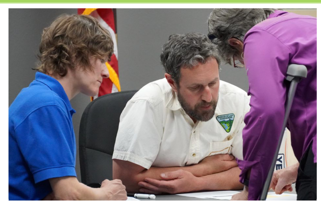
Wildlife Specialists Meet with Trail User

In addition to administering the SRP/ISRP program, resource protection monitoring, and maintenance and repair of recreation facilities, BLM plans to hire a park ranger to monitor the rivers' private and commercial use in UFO GGNCA. The monitoring data will help inform management decisions regarding setting limits on commercial use of the river corridor. BLM updates and improves its visitor information, including kiosks, websites, brochures, and mapping products. BLM will continue working with Delta County and Paonia to design trails in the Jumbo Mountain SRMA.