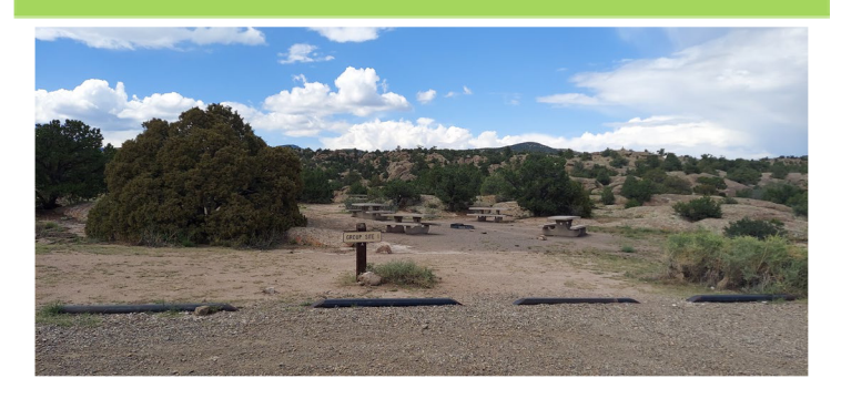
Penitente Canyon Groupsite Amenities

Penitente Canyon Campground (CG) is the staging area for experiencing the 4,552acre Penitente Canyon Recreation Area. This geologic wonder is managed primarily for its world-class rock climbing opportunities. Overnight camping, outfitters and guides, and special events have generated approximately $10,000annually in recent years. This funding is used in conjunction with other FLREArevenues to fund supplies, equipment, and salary for staff and volunteer hosts to maintain the CG.