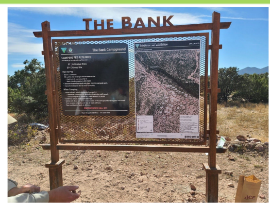
The metal kiosk installed at The Bank campground

The local office enhanced the visitor experience with informational upgrades. Kiosks were upgraded to a low maintenance modular style in both campgrounds in the Shelf Road Recreation Area. At the cost of $8900, kiosk upgrade and relocation of the fee station benefit the public by providing information in a logical place. The method of fee collection shifted to Recreation.gov, and camp hosts were brought in to help in the transition.