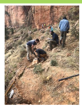
Volunteers working on the trail at Shelf Road

Shelf Road Recreation Area Project work was completed to improve climbing access. Through a partnership with Rocky Mountain Field Institute, both Shelf Road and Guffey Gorge were priority projects based on intensive visitor use accompanied by failing trail infrastructure. Guffey Gorge improvements on 94 linear feet of trail were accomplished. The cost of the assistance agreement was $25,000.