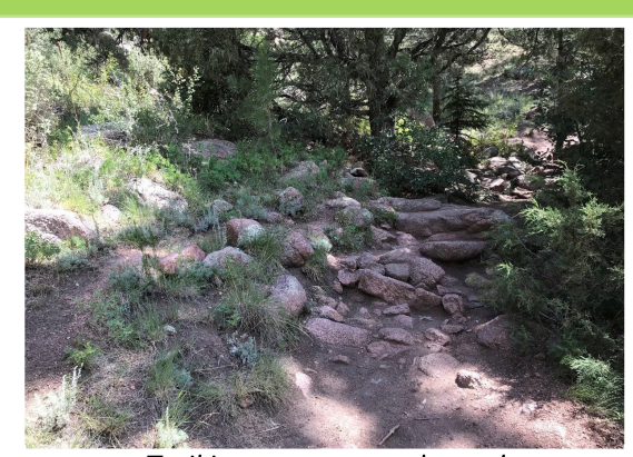
Trail improvements planned