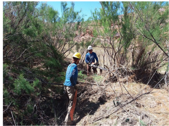
Youth Corps Crew Removing Invasive Tamarisk

Through our partnership with the Western Colorado Conservation Corps, we treated 15 acres of invasive tamarisk and secondary weeds such as Russian knapweed along the River. The removal is done in a phased approach, with native plant seeding based on the condition of remaining vegetation in treated areas. We completed cutting and piling of tamarisk and burned piles to reduce the risk of fire in native cottonwood galleries, improve riparian habitat, and improve camping opportunities for permit holders.