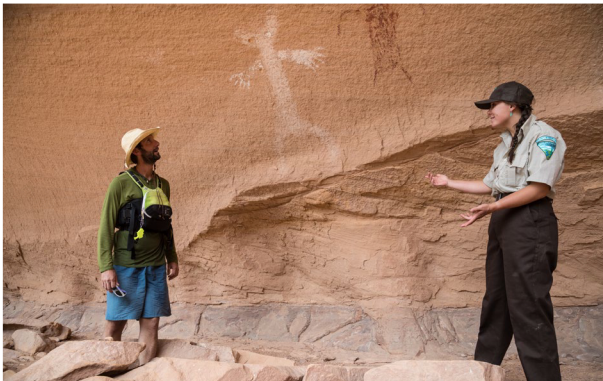
BLM employee teaches river users about Petroglyphs

In 2022 we plan to continue providing excellent service to permit holders and start a new Ruby-Horsethief volunteer river ranger program. We will be continuing our riparian restoration work at the May Flats and Blackrocks project sites. We continue to work toward additional acquisitions to improve access and conserve habitat. We also plan to implement the Rabbit valley permit system and make further improvements there. We plan to reinvigorate our youth education programs along the River in 2022 after canceling several trips due to the pandemic. We also plan to conduct a cultural resources inventory along the River.