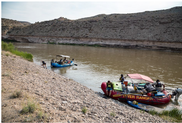
BLM staff patrol the Colorado River

The Ruby-Horsethief section of the Colorado River is 25 miles from Loma, Colorado, to Westwater, Utah. The flat water makes it an excellent trip for all boaters, from the most seasoned to beginners and families. There are 34 campsites available for reservation on Recreation.gov. The fees collected allow us to provide Park Rangers to answer questions on the phone and on the River. Our visitor services staff stay busy answering questions about campsite selection, gear requirements, and on the ground conditions