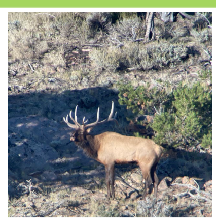
Bull Elk in Moffat County

Colorado boasts one of the largest elk herds globally, and the city of Craig, CO, is the "Elk Hunting Capital of the World." The Field Office permits and works with 60 big game outfitters to provide commercially guided hunts. The workload at LSFO involves meeting with permittees and processing paperwork. Approximately$55,000 was collected in FY 2021 and spent processing the permits, including necessary environmental documentation, on-site monitoring, and permit enforcement.