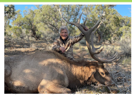
Big Game Hunting Guide in Moffat County