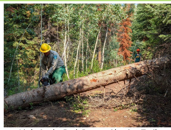
Little Snake Park Ranger Clearing Trail

The Emerald Epic is a series of races on BLMmanaged lands, with a seasonal trail closure for big game winter habitat. The LSFO staff works with the local mountain biking club to clean up the trails once the seasonal closure is lifted. Approximately $5,000 was collected from the event in FY 2021 and spent on trail clean-up and on-site monitoring.