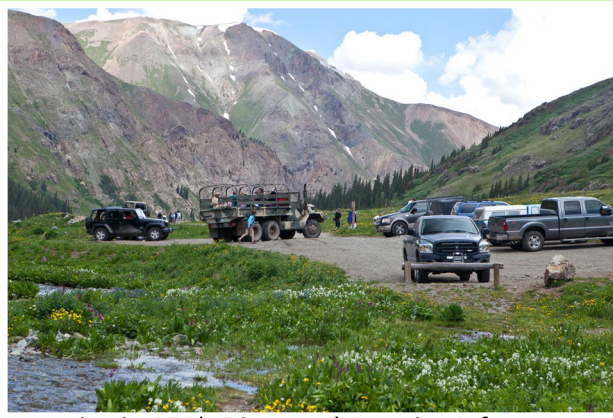
Investing in GFO's Dispersed Camping Infrastructure

In FY21, the Gunnison Field Office committed $42K to purchase fire rings for installation along the Alpine Loop. These fire rings will be installed in FY22 to designate 200 dispersed campsites in this destination recreation area. The project will partner with CPW, CYCA, and local govs. Designation of campsites is necessary to protect sensitive wetlands, alpine tundra, riparian areas, and cultural sites from the impacts of dispersed camping. Commercial groups and competitive SRPs heavily utilize the Alpine Loop.