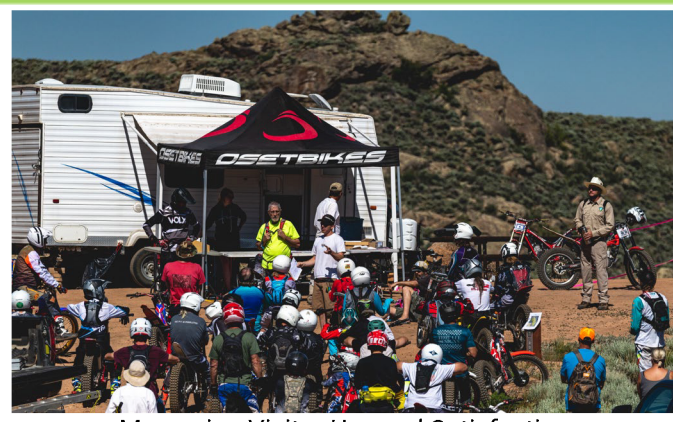
Measuring Visitor Use and Satisfaction

In FY21, the Gunnison Field Office committed $25K of 1232 funds to fund a visitor study and Government Performance and Results Acts (GPRA) Survey at Hartman Rocks Recreation Area in partnership with Western Colorado University (WCU). The task agreement funded a WCU Masters Student to install and monitor 14 traffic counters and conduct 177 Government Performance and Results Act Surveys to a random sampling of visitors between June and September 2021. The FY21 GPRA Satisfaction Measure was 98%.