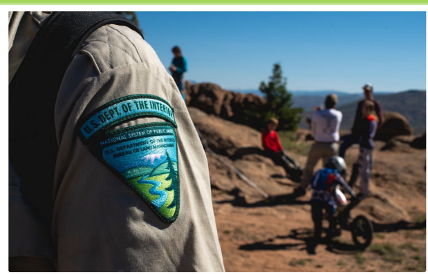
BLM Seasonal Monitoring a Motorized Event

GFO plans to field three campground hosts in FY22 (an additional host at Hartman Rocks) with a projected total reimbursement of $11,000. These hosts will continue to orient visitors, maintain facilities, and manage reservation systems. GFO has committed $38,000 in a task agreement with Colorado Youth Corps Association to fund two developed recreation/wilderness interns and a visitor use assistant intern to maintain facilities, orient and educate visitors, and process fees. GFO will employ 2 additional 6-month (1,039 hour) recreation park rangers; a total of $49,123.92.